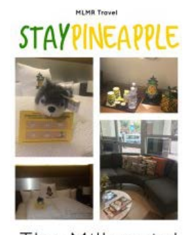
The Millennial Hotel of Your Dreams