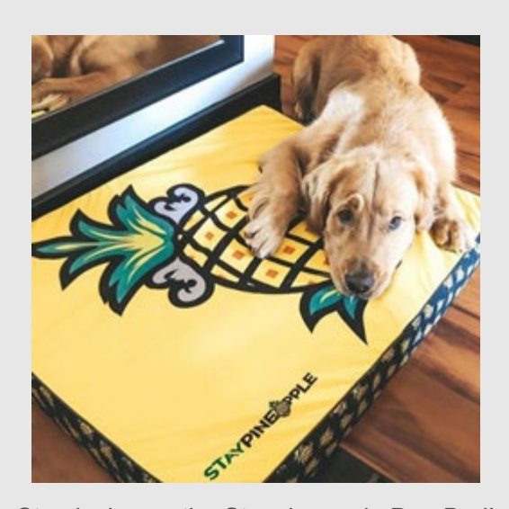
Starsky Loves the Staypineapple Dog Bed!

Staypineapple wants you to know that it's okay to leave your fur baby in the room while you go exploring. Just use the appropriate door hanger on your way out. If you and Fido go