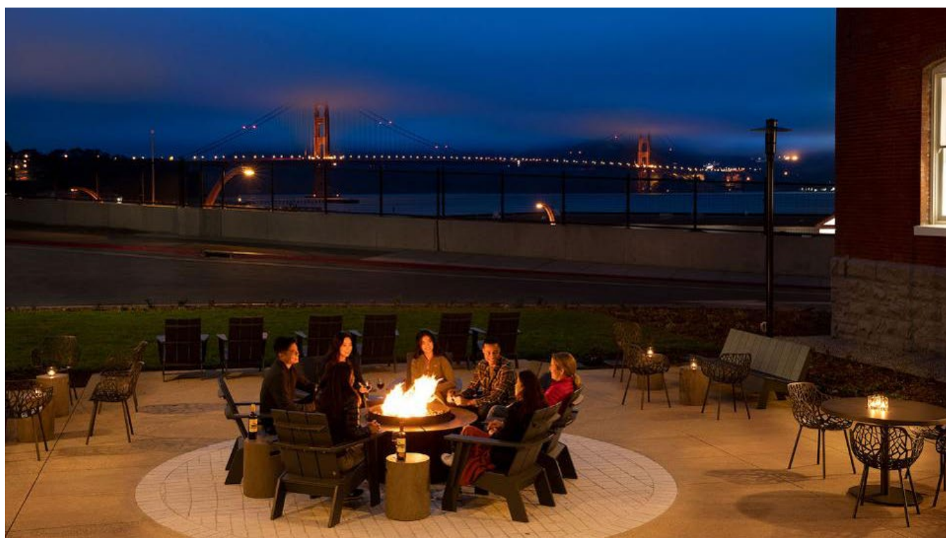
LODGE AT THE PRESIDIO

Complimentary breakfast and afternoon appetizers are served in the spacious living room/dining room area, and San Francisco's iconic food trucks take over the Main Parade Ground across the street every Sunday for the beloved family-friendly Presidio Picnic curated by Off the Grid.