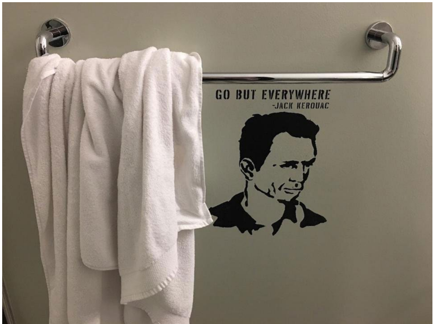
Look who's peeking out from your towel rack at Hotel Emblem.

Inspired by the Beat Generation, with tributes to and quotes from writers like Jack Kerouac and Allen Ginsberg on the carpets, the walls and under your towels, Hotel Emblem is one of the oldest buildings in the city – yet it's got one of the trendiest vibes.