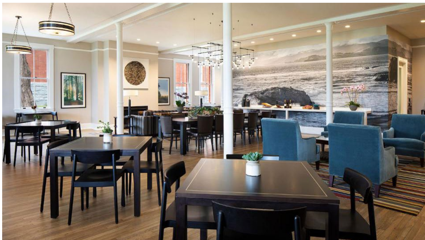
The living room/dining room area at Lodge at the Presidio. LODGE AT THE PRESIDIO

Complimentary breakfast and afternoon appetizers are served in the spacious living room/dining room area, and San Francisco's iconic food trucks take over the Main Parade Ground across the street every Sunday for the beloved family-friendly Presidio Picnic curated by Off the Grid.