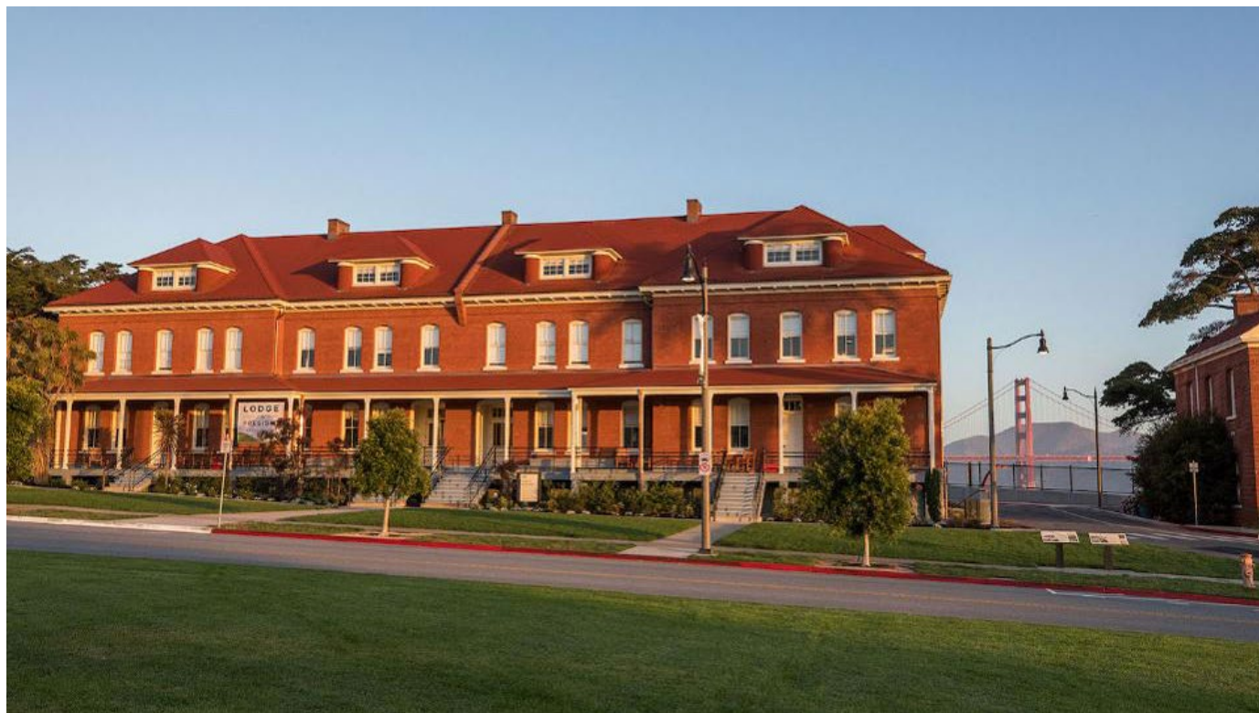
Lodge at the Presidio offers breathtaking views of the Golden Gate Bridge.

Just a free shuttle ride from downtown, you can stay in a gorgeous National Park setting for a truly unique San Francisco experience.