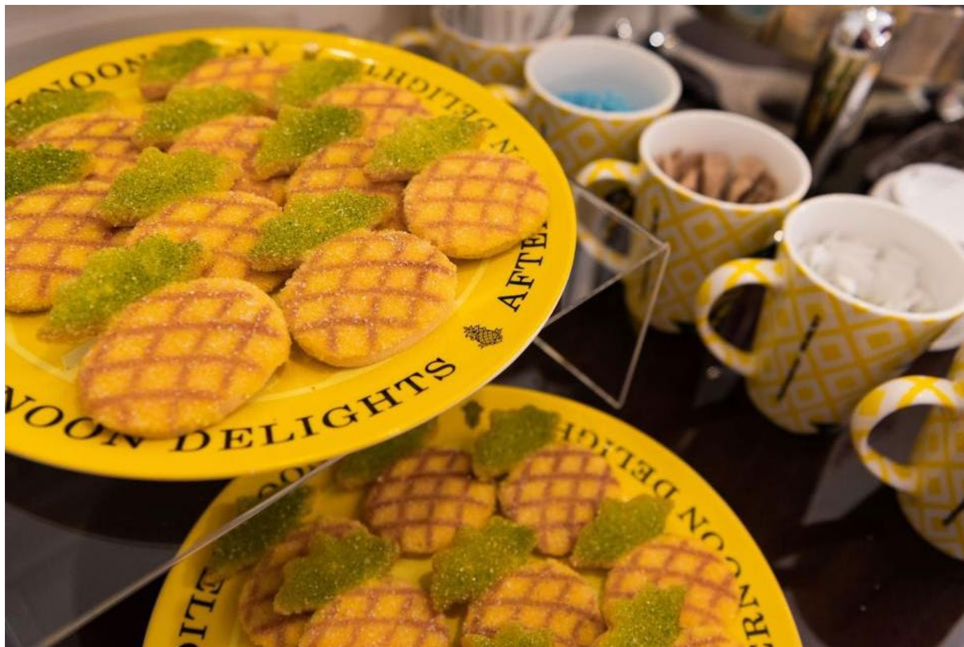
Staypineapple cookies are an afternoon delight. STAYPINEAPPLE

In the lobby, the Pineapple Bistro & Bar serves up breakfast and small bites, along with local wines and beers. Do not miss the complimentary afternoon delights – the signature cookies are as delicious as they are Instagrammable.