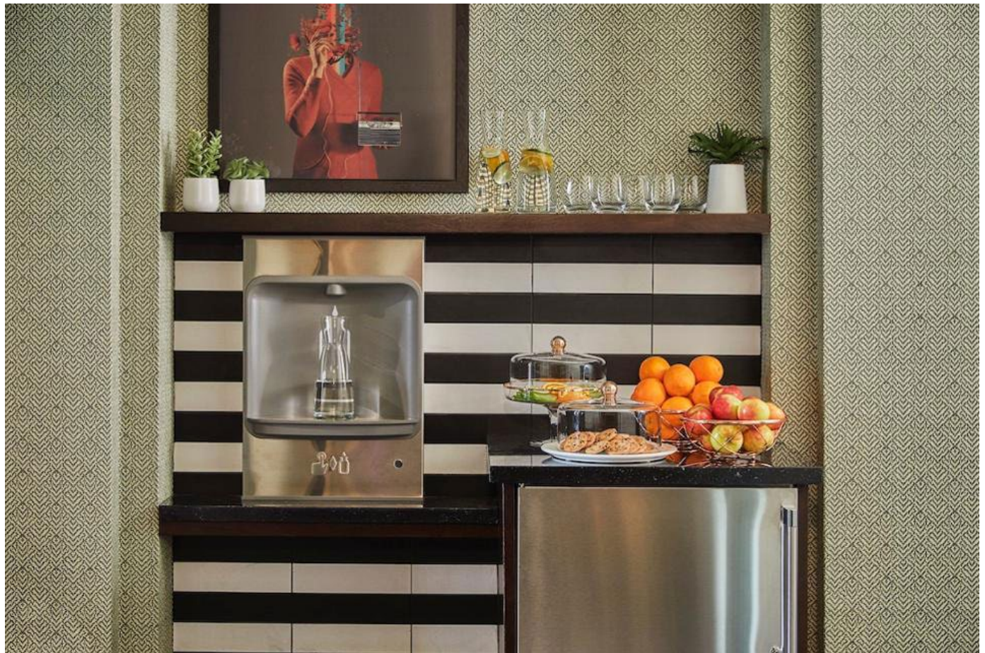
A complimentary water station on every floor keeps you hydrated and prevents you from getting hangry.

Hotel Emblem is located just a few blocks from Union Square, and you can set out on the road less traveled thanks to half a dozen unique self-guided city tours created by the hotel's Underground Concierge. Or you can walk to City Lights , the legendary indie bookstore, and stock up on books to read while you indulge in the award-winning pizza at Tony's Pizza Napoletana down the street.