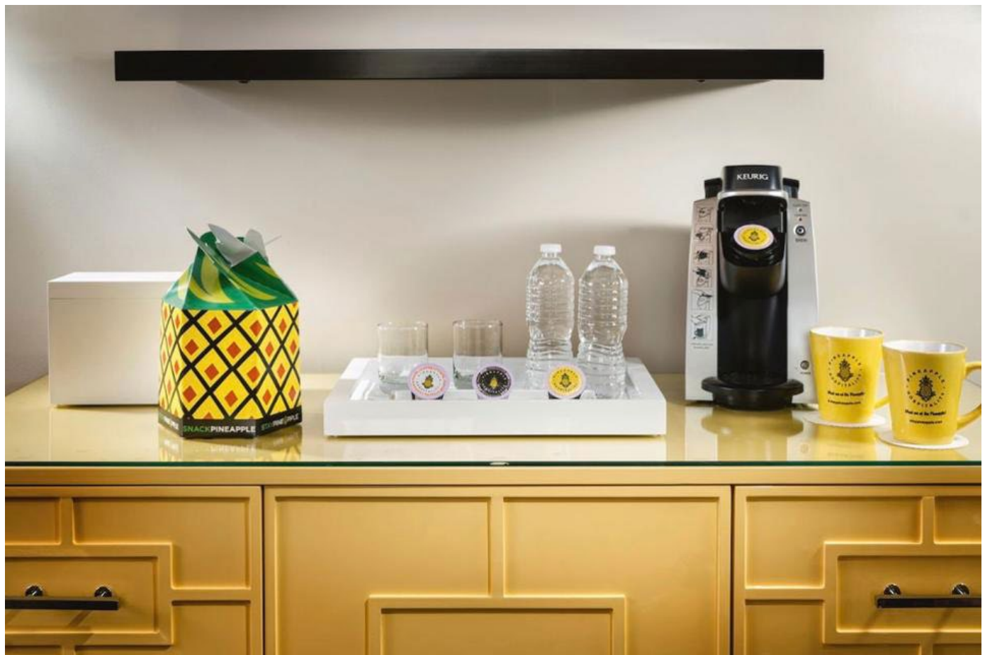
Staypineapple amenities include a snack box and complimentary drinks. STAYPINEAPPLE

Staypineapple's stuffed husky welcomes you atop cozy beds stacked with plush duvets and cushy pillows. There's a pineapple charging station for your devices, all the bottled water you can drink and an in-room snack box that takes the place of a mini bar.