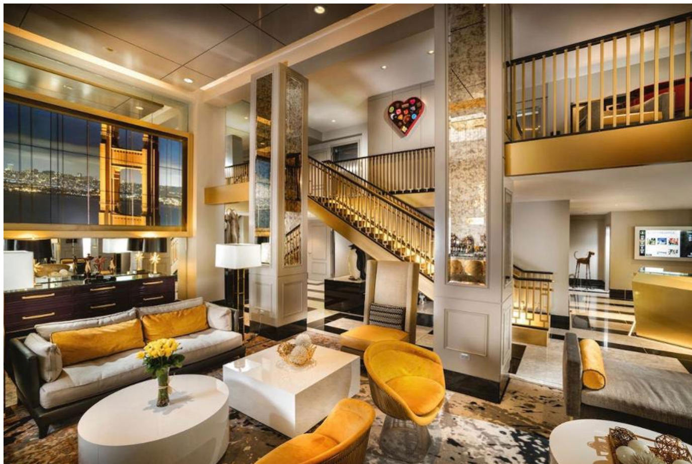
The lobby at Staypineapple. STAYPINEAPPLE

The pineapple is the universal sign of hospitality, and it's an apt logo for this cheery downtown hotel. A sophisticated little jewel box in the middle of the busy city, Staypineapple has a fun, irreverent attitude and bright hotel rooms that are well-designed and well-equipped.