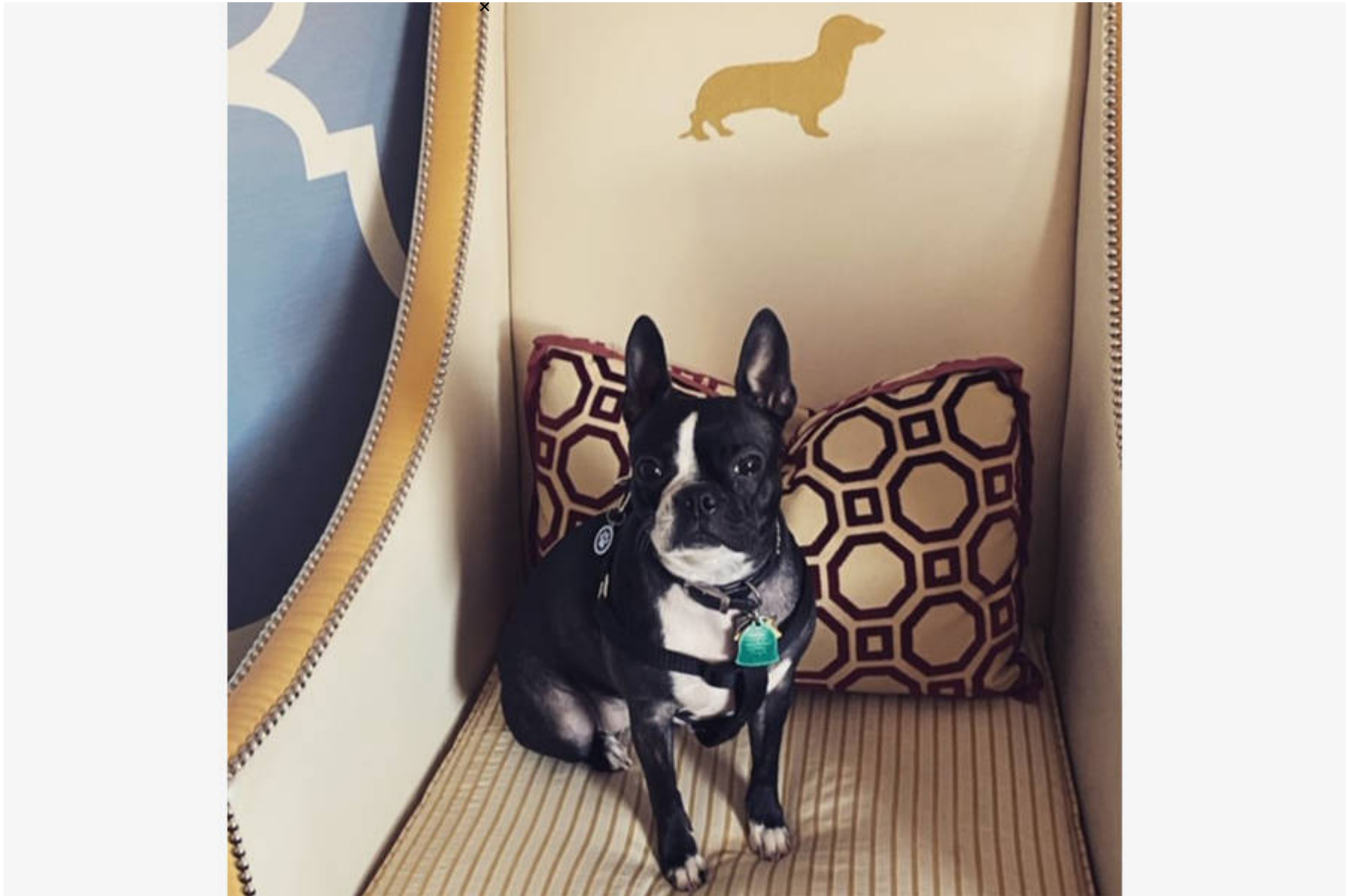
The Muse.