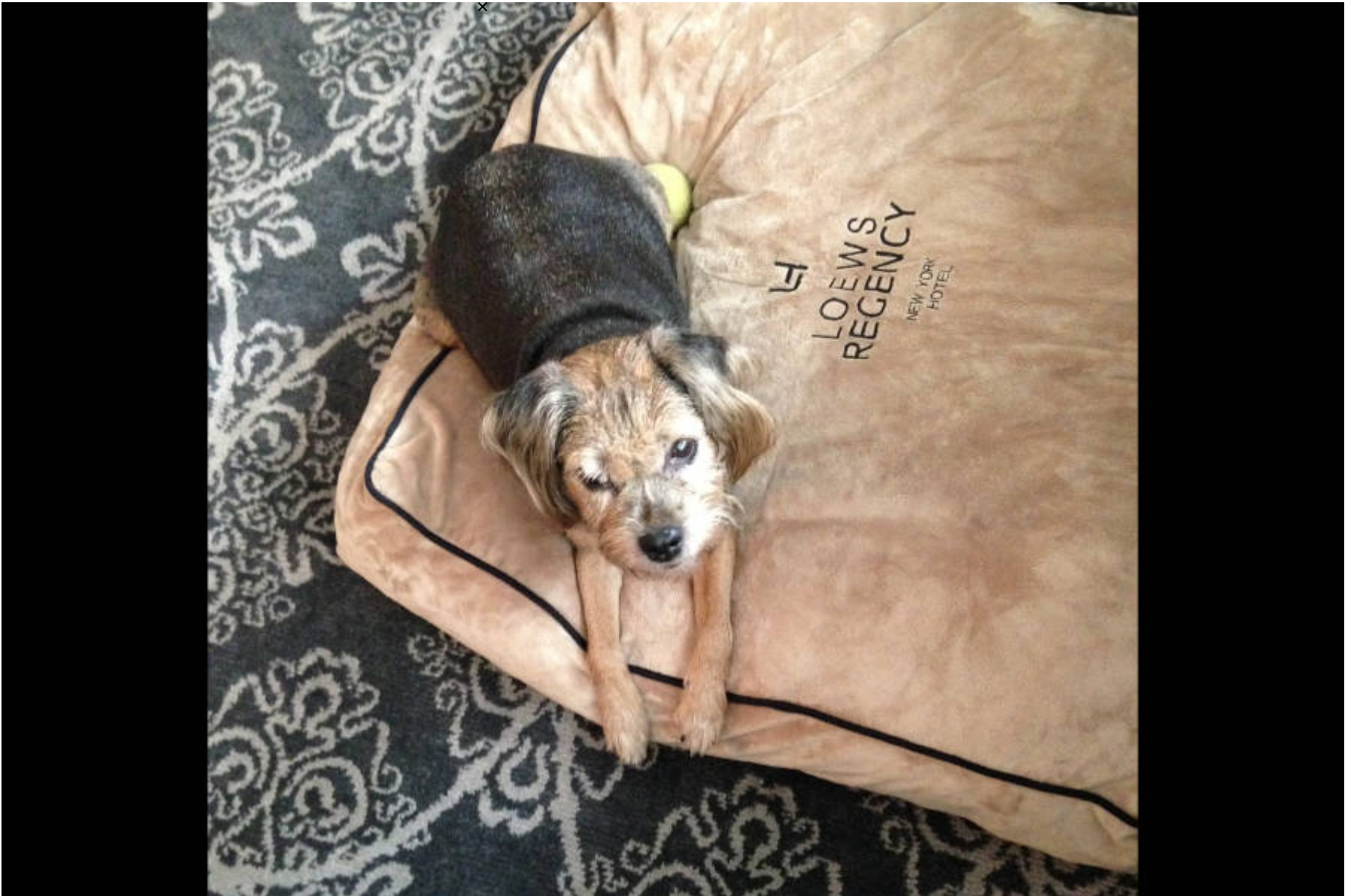
Loews Regency Hotel.

Loews Regency Hotel (/hotels/loews-regency-new-york)