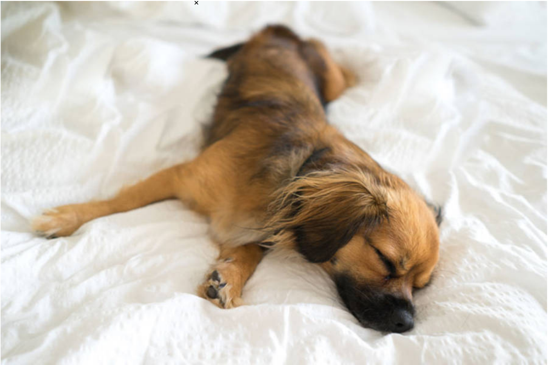
Park Lane Hotel.

Park Lane Hotel (/hotels/park-lane-hotel-new-york)